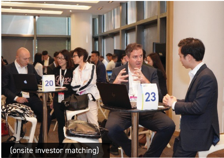
(onsite investor matching)